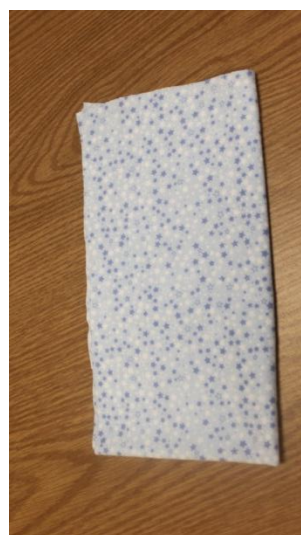
Fold in half again