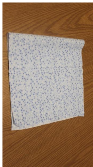
Fold in half